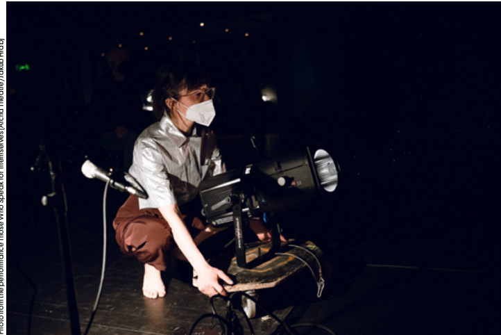
Photo from the performance 'Those Who Speak for Themselves'

"A brilliant opportunity for any artist! Challenging and inspiring • lots of ideas to further develop current projects and ideas for new ones, I've gone back and gone straight into projects with excitement and determination. Met incredible artists working in Archa and participants of the summer school. Loved it, thanks so much for an inspirational two weeks."