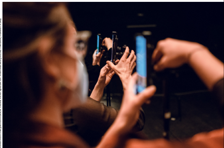
Photo from the performance Those Who Speak for Themselves (Archa Theatre / akabihrab)

There is a limited capacity for participation. Selection of participants will be announced by 13 July 2021 .