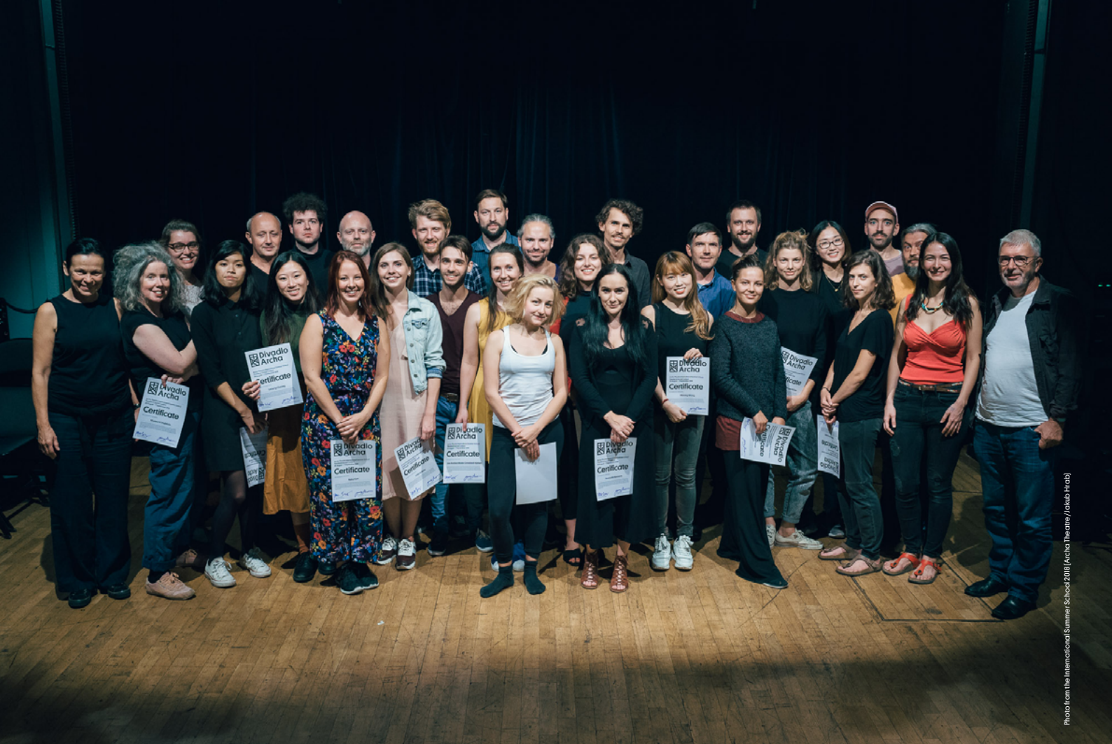
Photo from the International Summer School 2018 (Archa Theatre / Oskub Hrad)